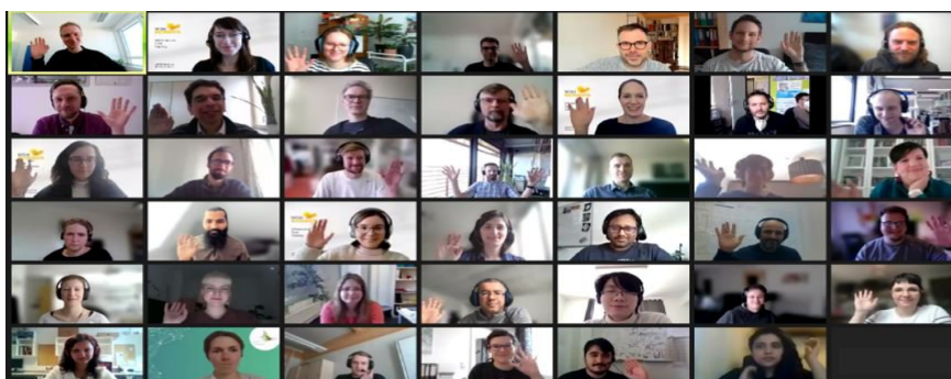
Screenshot of the 5 th Community Workshop

The NFDI4Microbiota community is growing! Our 5 th Community Workshop took place virtually, launching the NFDI4Microbiota Ambassador program. Our ambassadors are a direct and bilateral connection between NFDI4Microbiota and the community by helping to identify and communicate the needs of their local community and, in return, provide the community with suitable solutions generated by the NFDI4Microbiota consortium. More information and the registration link for the ambassador program can be found here . Further requests and questions can be sent to ambassador@nfdi4microbiota.de .