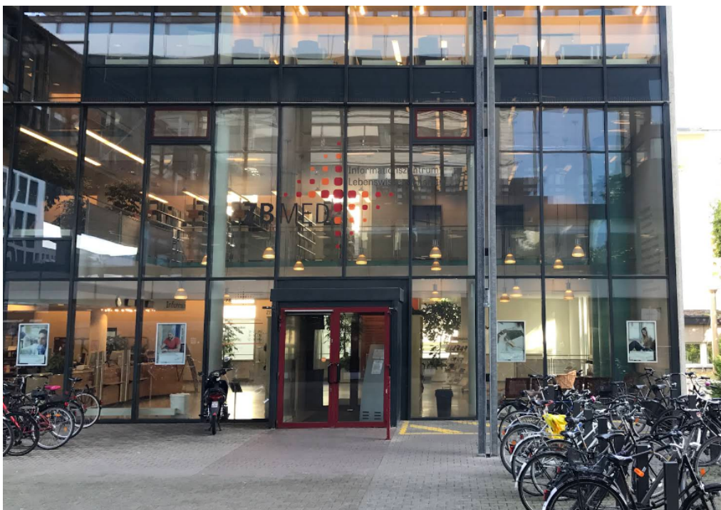
ZB MED library entry.