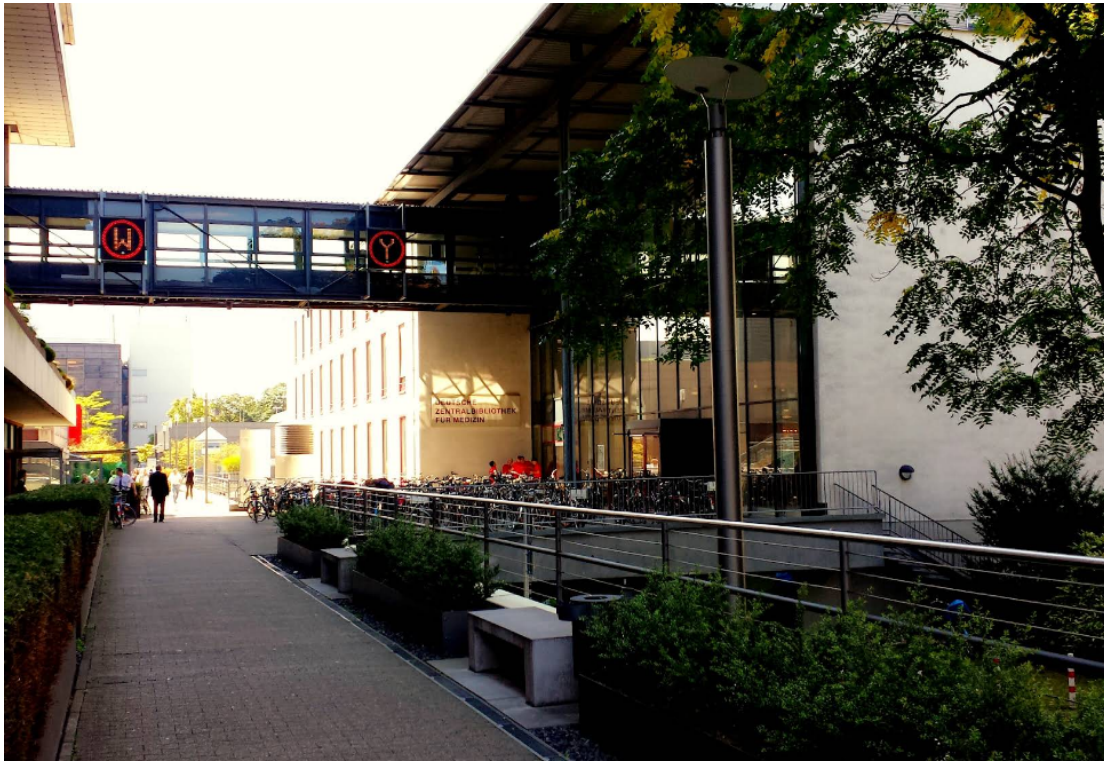
Path to ZB MED library entry.